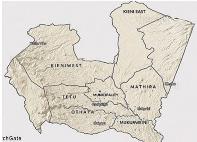
Map of Nyeri County